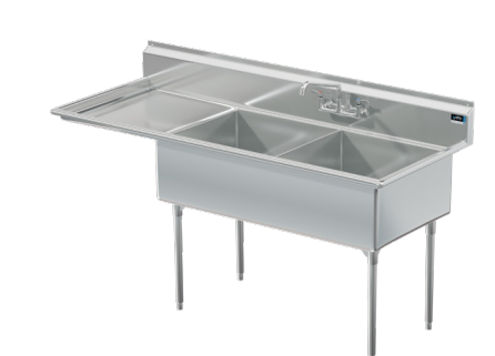
Bowl (Lg x Wd x Dp)