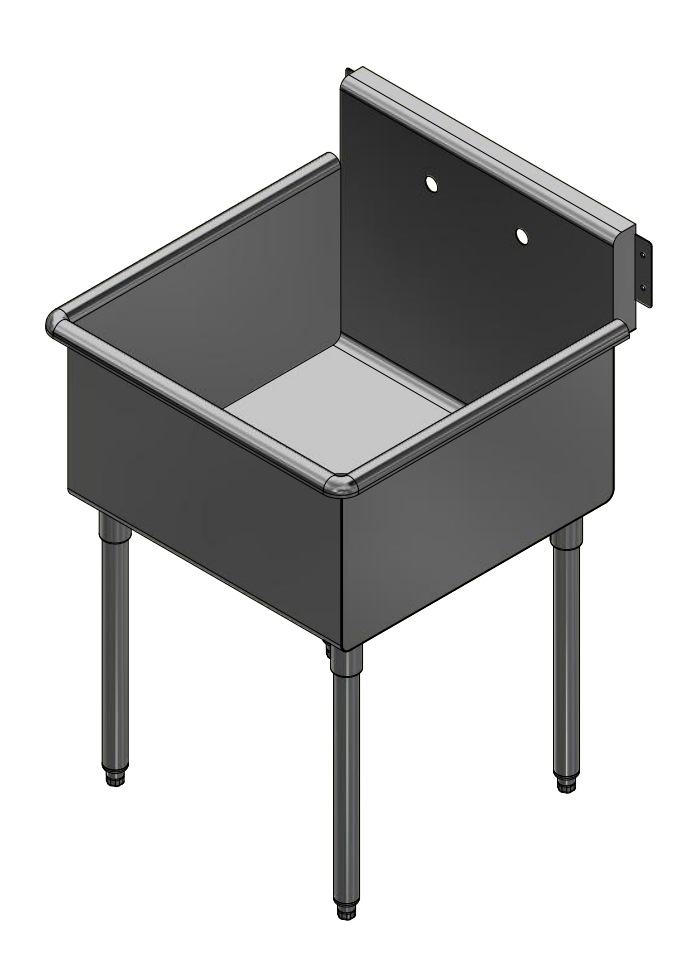
3D SCALE 1/12